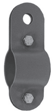
Full Pipe Clamp 026-22X1.5H